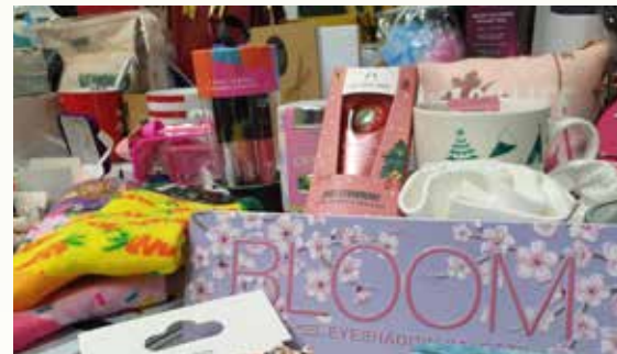
ABOVE & BELOW A peek into last year’s Christmas gift room